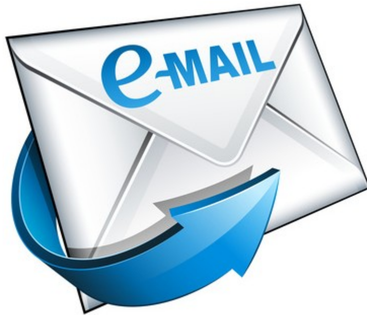
FIG 3.11: E-Mail