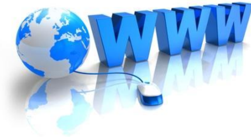
FIG 3.12: World Wide Web