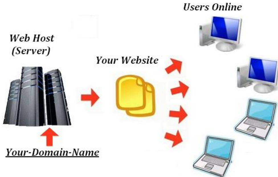
FIG 8.3: Web Hosting