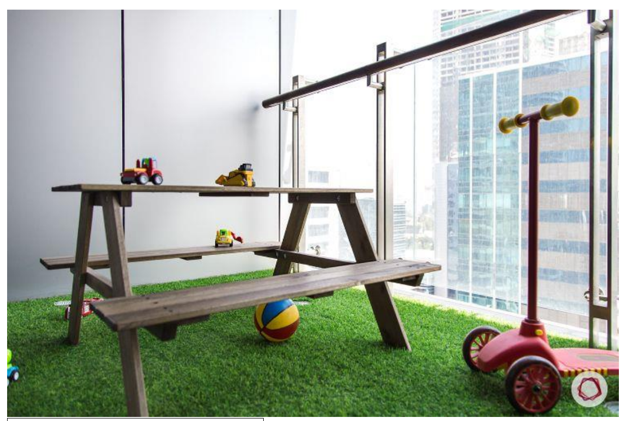
Outdoor play area in our own balcony

If you don't have a dedicated play area for your toddler, fret not! Your large balcony can be turned into an entertainment space for your child, while you can stretch your legs too! Lay out some turf to cushion falls, add an outdoor bench for homework time, and ensure you have high railings for extra safety. This is a great way to get your kids out in the fresh air without having to go too far.