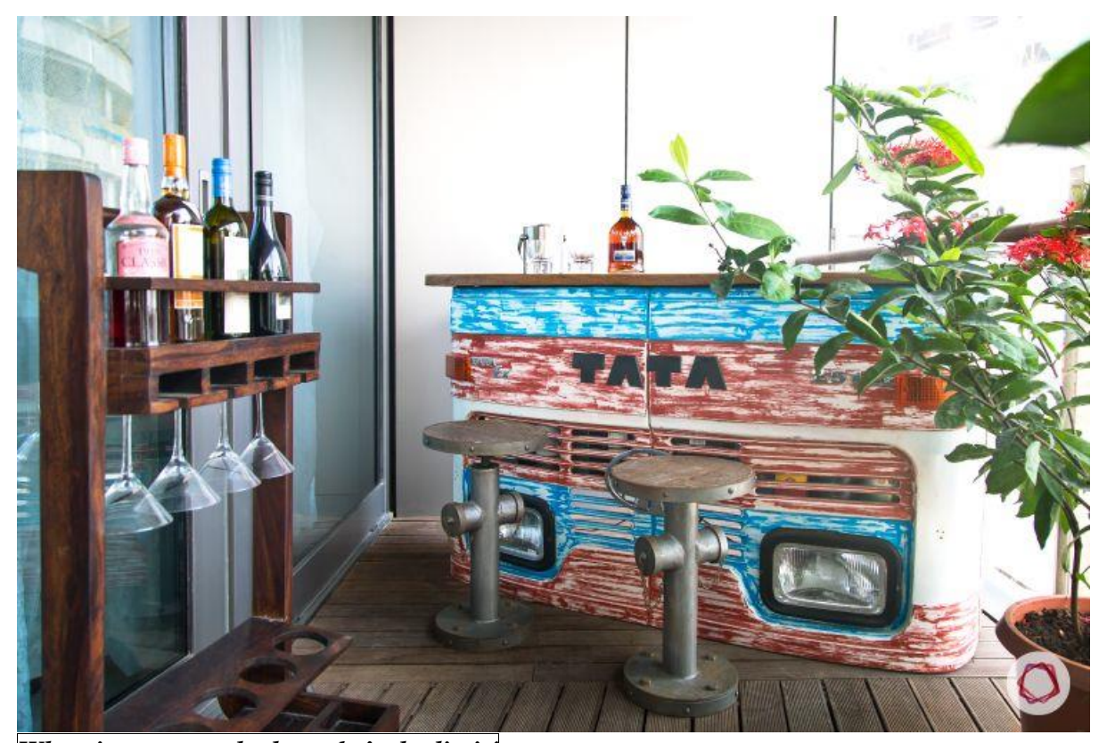
When it comes to the bar, sky's the limit!

Set up a private sky bar in your balcony with a mobile cart and rugged bar counter. In these types of outdoor balcony design ideas, the rustic wooden flooring coupled with the inventive and narrow bar stand, creates a simple look, without cluttering the space. The