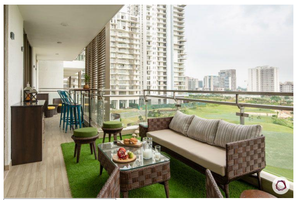
The best of everything squeezed in!

Make the most out of your large balcony by picking furniture that will allow you to turn it into a multi-purpose space. This all-in-one balcony is an ultra-functional area that packs an outdoor seating area with a plush sofa, a sky-gazing spot with high chairs, and a reading spot at the far corner with comfy chairs. It is one of the most comprehensive outdoor balcony design ideas you can emulate!