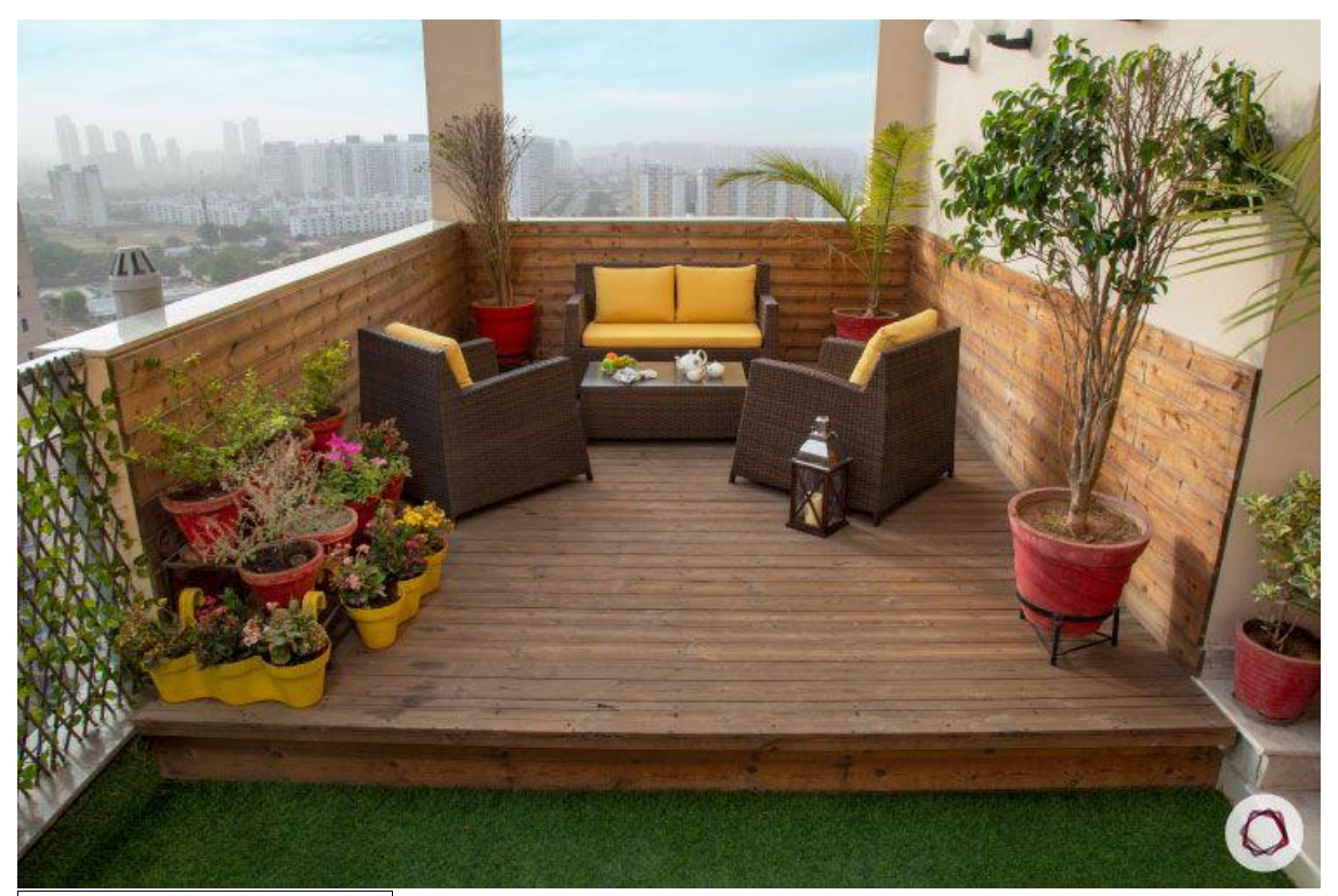
A deck for outdoor parties

Capitalize on sectioned off balcony space by turning it into a party deck! This design uses a wooden deck and wall tiles to define the space, and leverages welcoming patio furniture for a relaxing vibe.