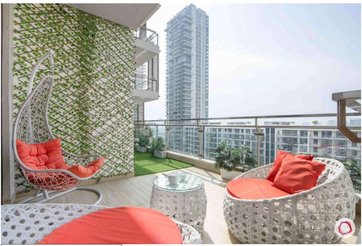
A garden that touches the sky!

It is refreshing to behold a vertical garden, when you are perennially surrounded by concrete towers. While there are many ways to set up a decorative green wall, some outdoor balcony design ideas such as this use a criss-cross wooden frame to support the creepers. The patterned furniture, from seating to the swing, mirrors the design and creates an eclectic theme.