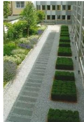
Figure 3.5 Repetition