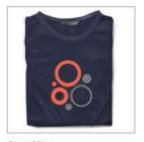
Step Nine Finished product.