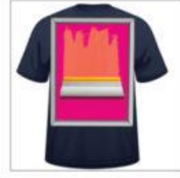
Step Seven Ink is applied to open areas of screen with a squeegee. Repeat for each color (including base as needed).