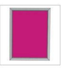
Step Three Mesh screen is coated with light sensitive emulsion.