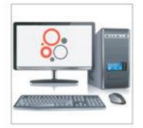
Step One Artwork is created as vector files using graphic design applications.