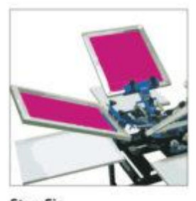
Step Six Screen, ink, and garment are set up on machine.