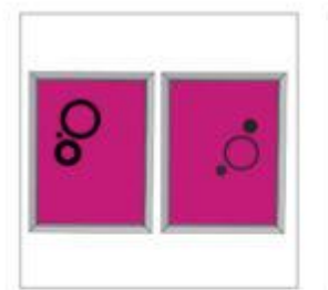
Step Four The acefate is vacuum sealed against the screen and the emulsion is cured using UV light to block out the image.