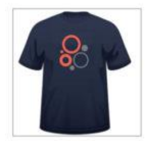
Step Eight The garment goes through a dryer to cure ink permanently on the fabric.